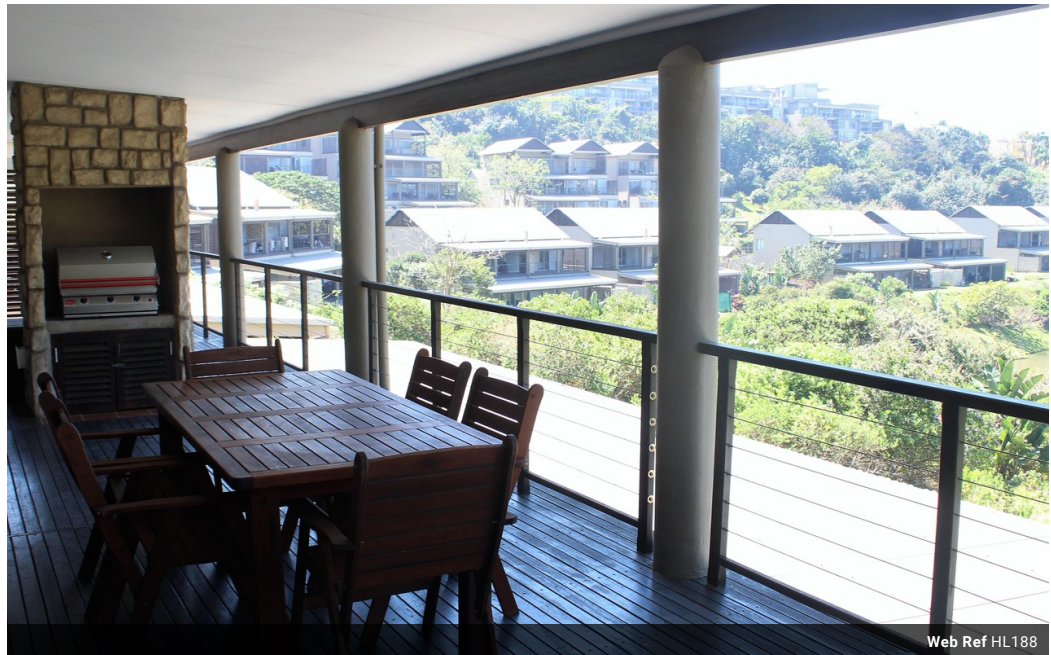
Web Ref HL188

42 Cussonia Way Shaka's Rock Drive Ballito 4420