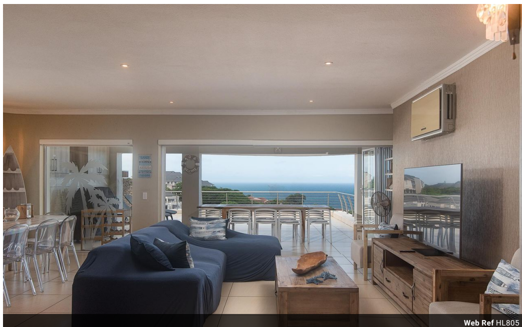
Web Ref HL805

42 Cussonia Way Shaka's Rock Drive Ballito 4420