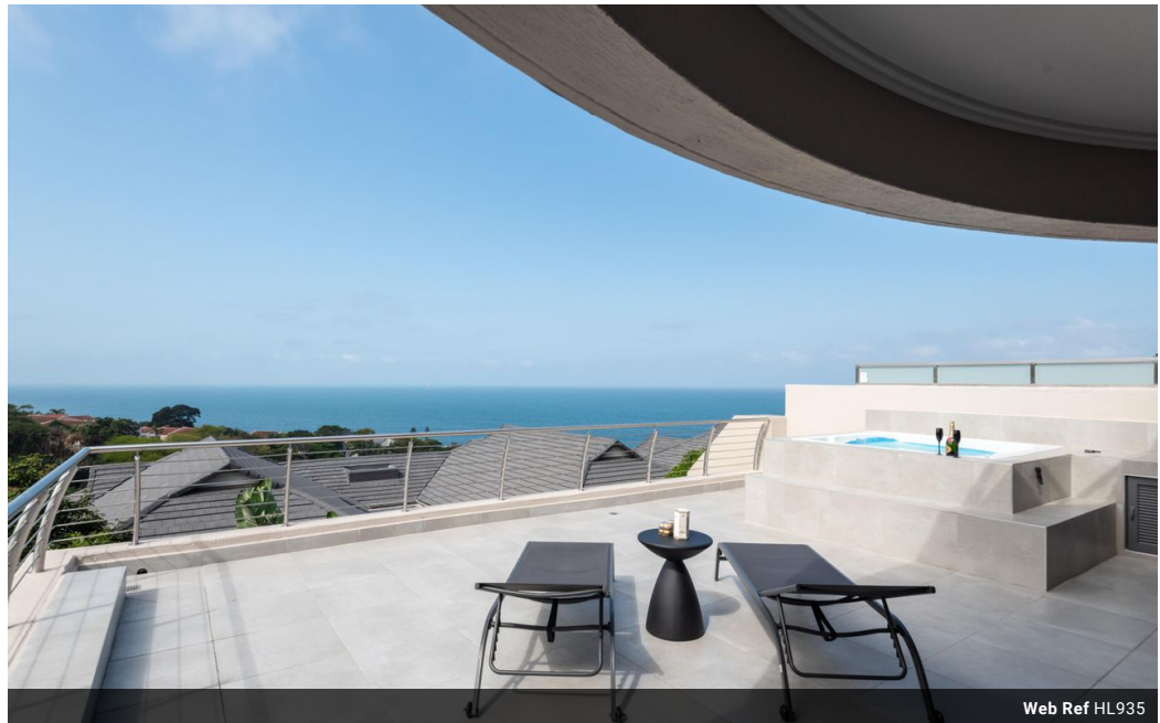
Web Ref HL935

42 Cussonia Way Shaka's Rock Drive Ballito 4420